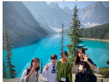
Canadian Rocky Mountains