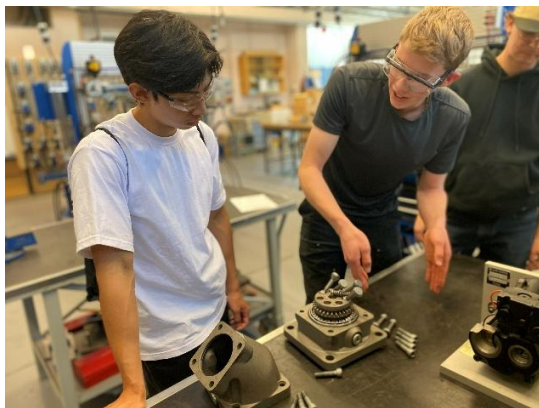
Class Experiences with Canadian Students